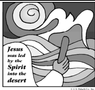
Jesus was led by the Spirit into the desert